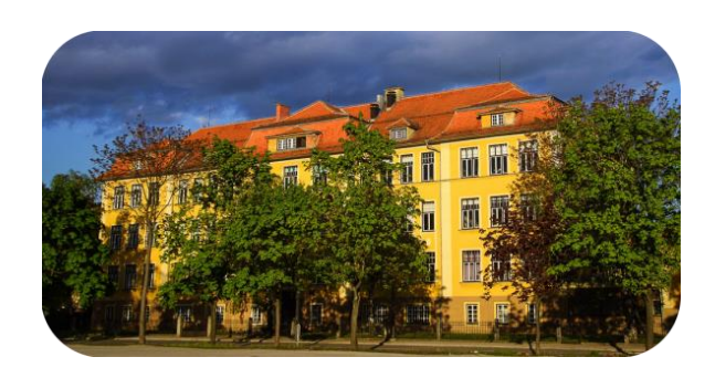
I. OSNOVNA ŠOLA 13, Vrunčeva street, Celje